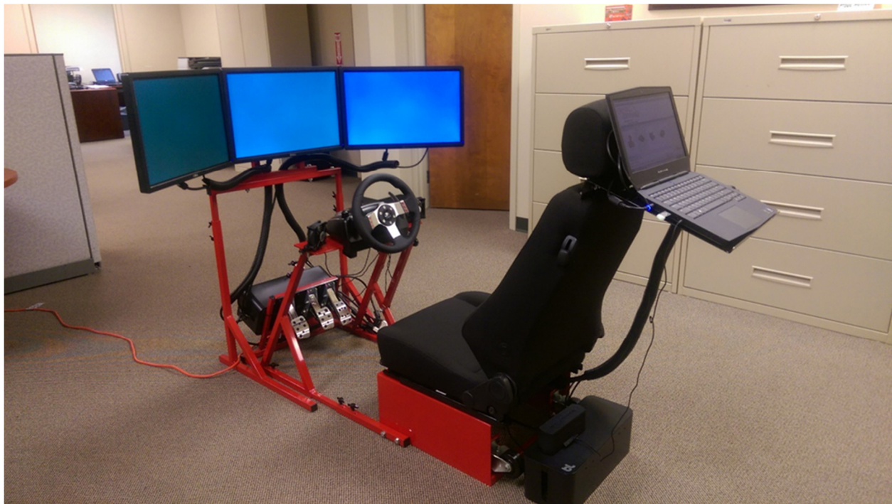
STISIM Drive M100WS-Console-DT

STISIM Drive®-DT is a fully interactive virtual reality driving simulator engineered to take advantage of cutting edge computer technology. Results from more than four decades of independently validated driving simulation research are incorporated into STISIM Drive® software and systems. More than 500 universities, government agencies, medical facilities, training centers, and corporations have used STISIM Drive® to conduct research, perform patient assessment and treatment, and provide driver training.